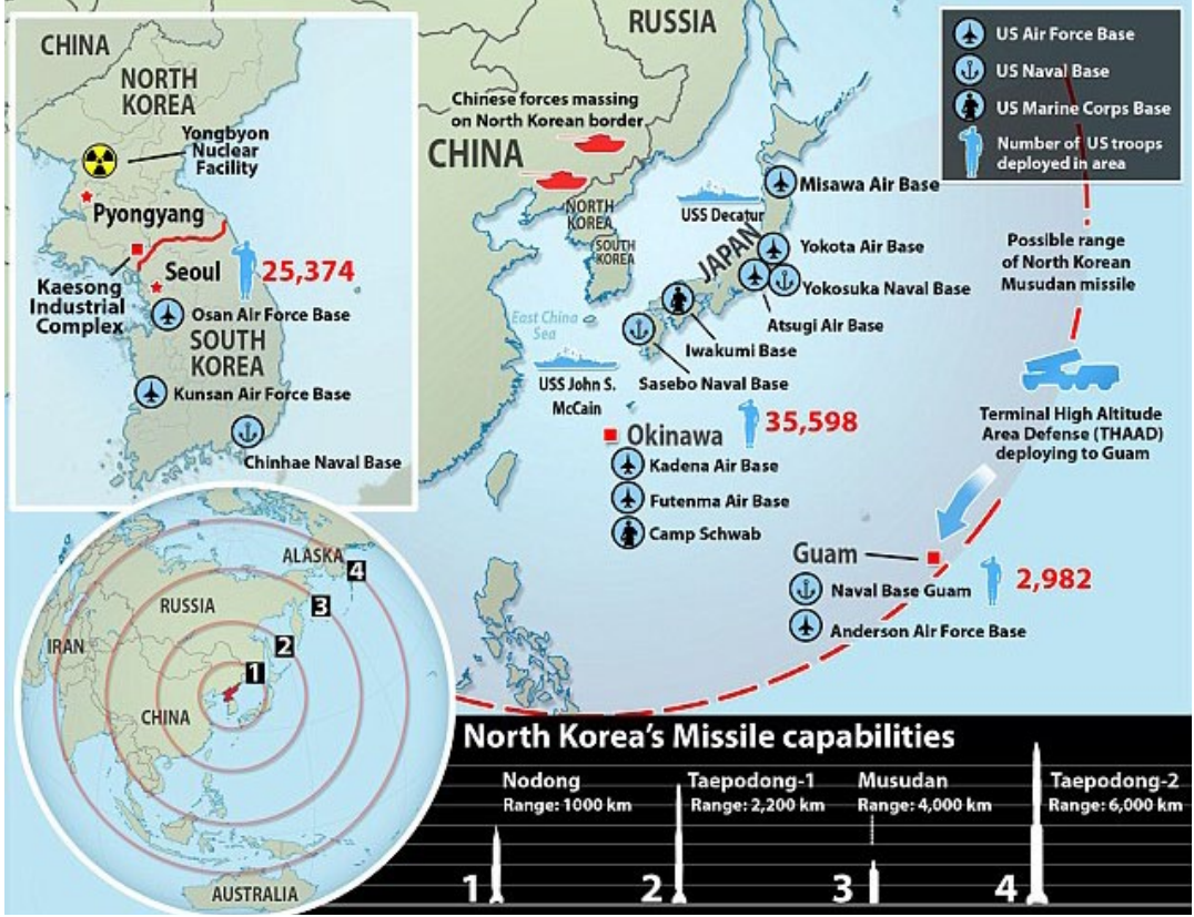
North Korea Missile Ranges.

The combination of political chaos in South Korea, a volatile dictator in North Korea, and a US President who makes unpredictable foreign and nuclear policy announcements via Twitter – is a dangerous and unprecedented mix of factors in the troubled Korean peninsula situation. A deteriorating US-China strategic relationship may provide a window for Pyongyang to use the evolving DPRK missile and nuclear capability before it is neutralized by the deployment of US missile defence systems later this year.