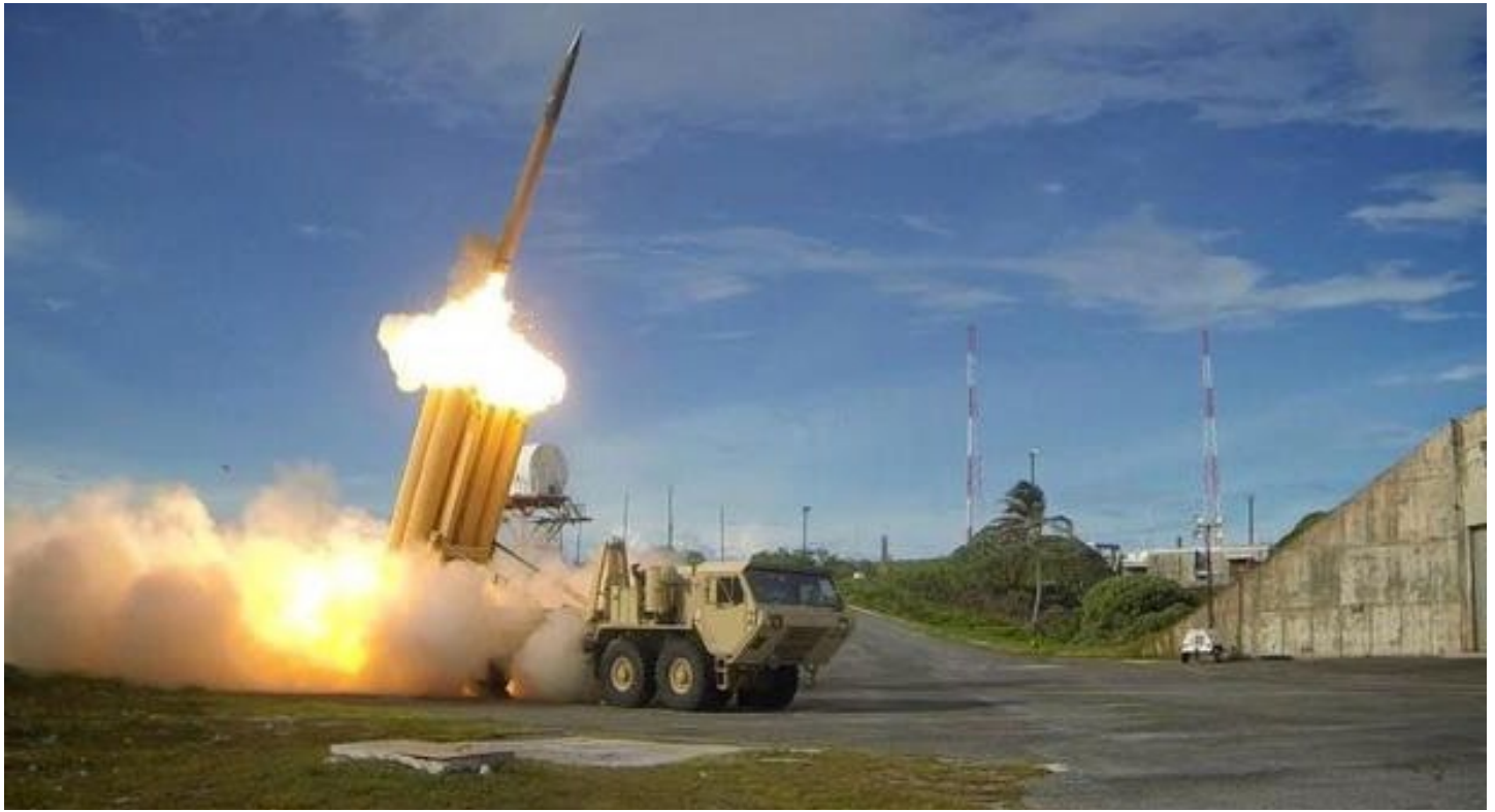
A terminal high altitude area defense THAAD interceptor is launched during a successful intercept.

away – most notably on the West Coast of America. Paired with nuclear warheads the thought of the DPRK holding Los Angeles or San Francisco at risk is truly sobering. However, in balance, while a North Korean ICBM may be a highly effective political chess-piece, it may be of less value