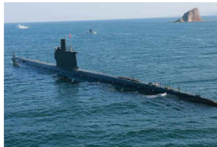
North Korea submarine.

“ Finally there is the latest KN-08 [...] The true capability of this system is still unknown, but one upper limit puts it at 12,000km – putting most of the continental US within reach. ”